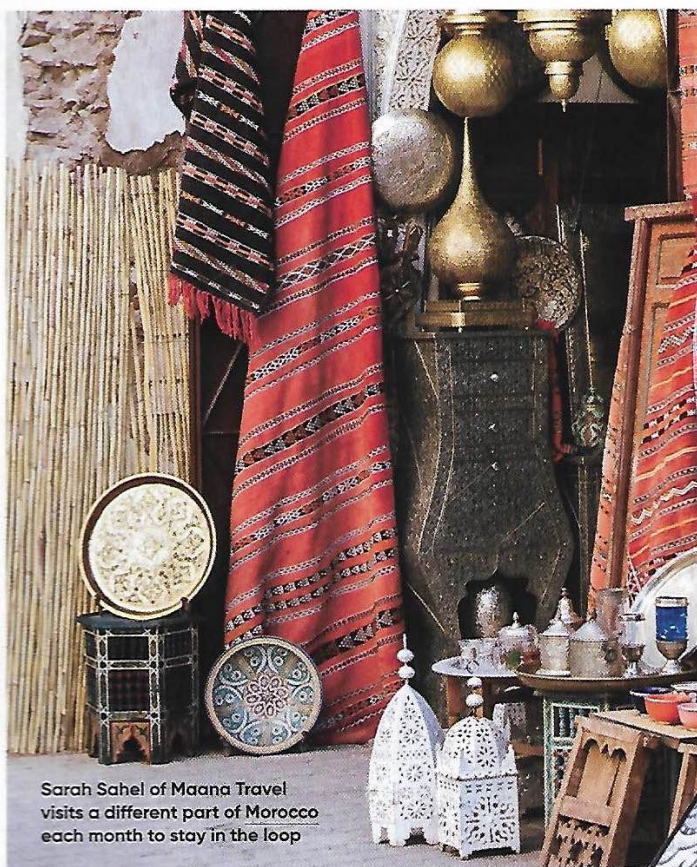
Sarah Sahel of Maana Travel visits a different part of Morocco each month to stay in the loop